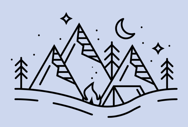
graphic of a tent in the mountains

Paddle Boats/Canoeing Swimming (Pool) Arts & Crafts, Adapted Games Educational Workshops Field Trips (Many different places) Hiking/Walking trails Horseback Riding Motorcycle rides (Passengers) And so much more!