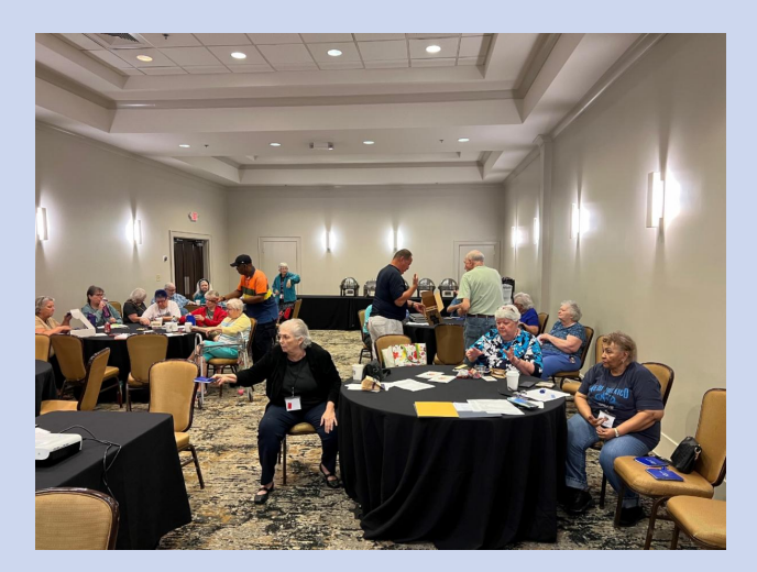
Deaf seniors sitting at multiple round tables in the conference space.

To learn more about Deaf Seniors of Georgia, visit their website: <u>https://www.deafseniorsgeorgia.org/</u>