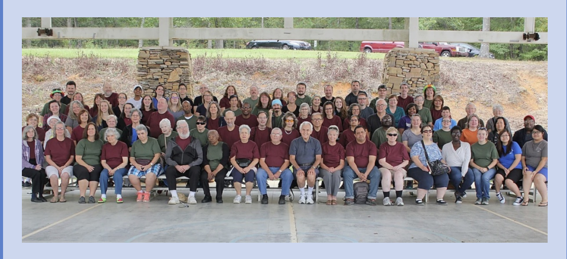
Group photo of DBAS campers and SSPs from the 2017 retreat

It is almost time for the 2023 DeafBlind Access of the South (DBAS) retreat. This years retreat will be from October 3rd - 8th at Camp Twin Lakes in Rutledge, GA.