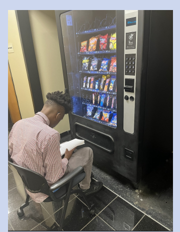
client doing inventory on a snack machine